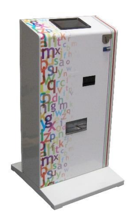
DRC9STD autonomous dispenser/reloader